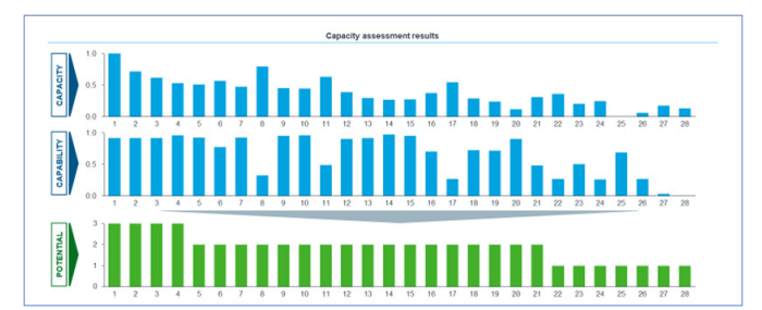
Figure 2 Capacity assessment results.

In an interim analysis of 28 out of 40 hospitals, hospitals were segmented into three groups (0–100% ratio scale) based on their readiness, determined by their capacity and capability. Four hospitals were included in segment A, 17 in segment B and 7 in segment C.